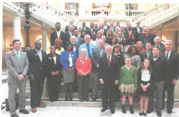
HCBA at the Capitol 2016

He is a member of Shiloh Baptist Church, Alpha Phi Alpha Fraternity, Inc, the NAACP and Henry County Youth Track Association. In his spare time he enjoys golf, genealogy research, travel and physical fitness. He also prides himself on being the first person in his maternal family to attend college.