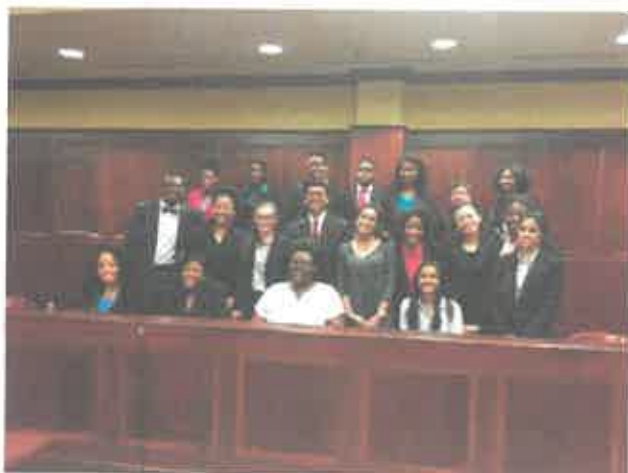
Mock Trial District Winners 2016 - Eagle's Landing