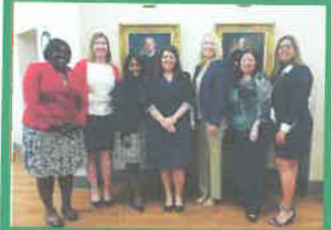
Special thanks to all who supported the event through their donations and time